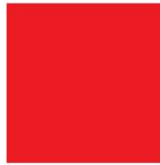
SIGNAL RED GM2402