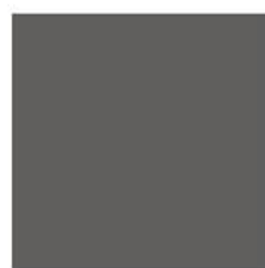
PAPIER GREY GM2139