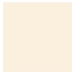
ASH GREY GM2306