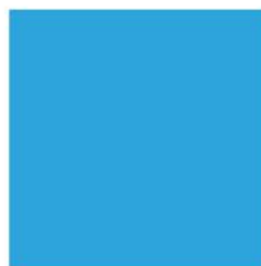
PEARL BLUE GM2477