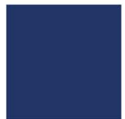
TNB BLUE 2006