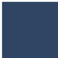
MARINE BLUE GM2649