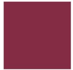
PLUM RED GM2154