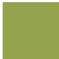
HAZE GREEN GM2117